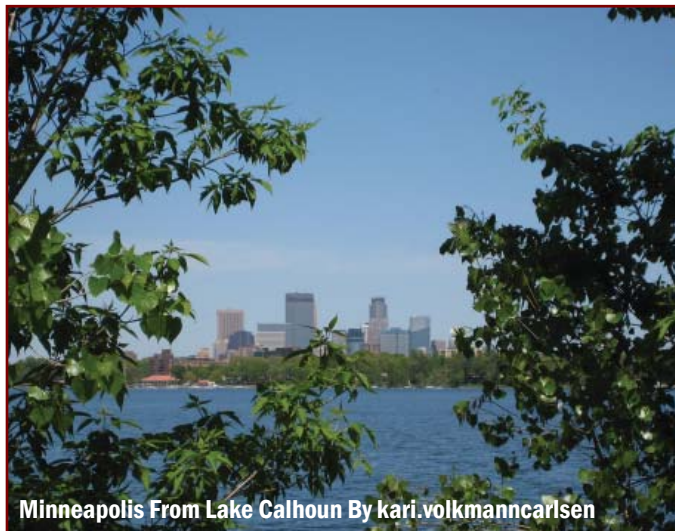
Minneapolis From Lake Calhoun